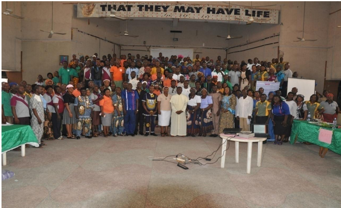
Cross section of JDPC Members and Guests at 2017 JDPC Week Flag-off