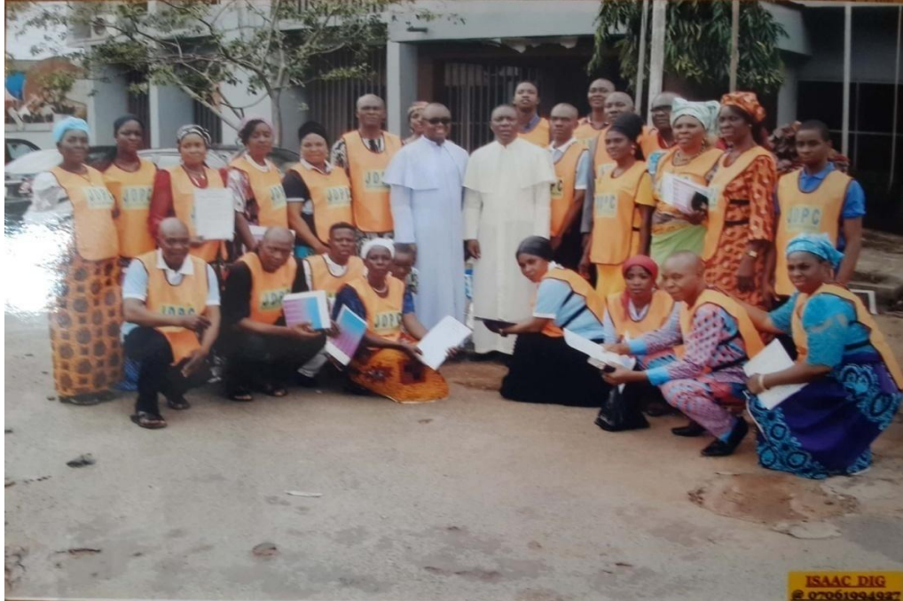
Inaugurated members of JDPC St. Mary's Parish Inland town Onitsha