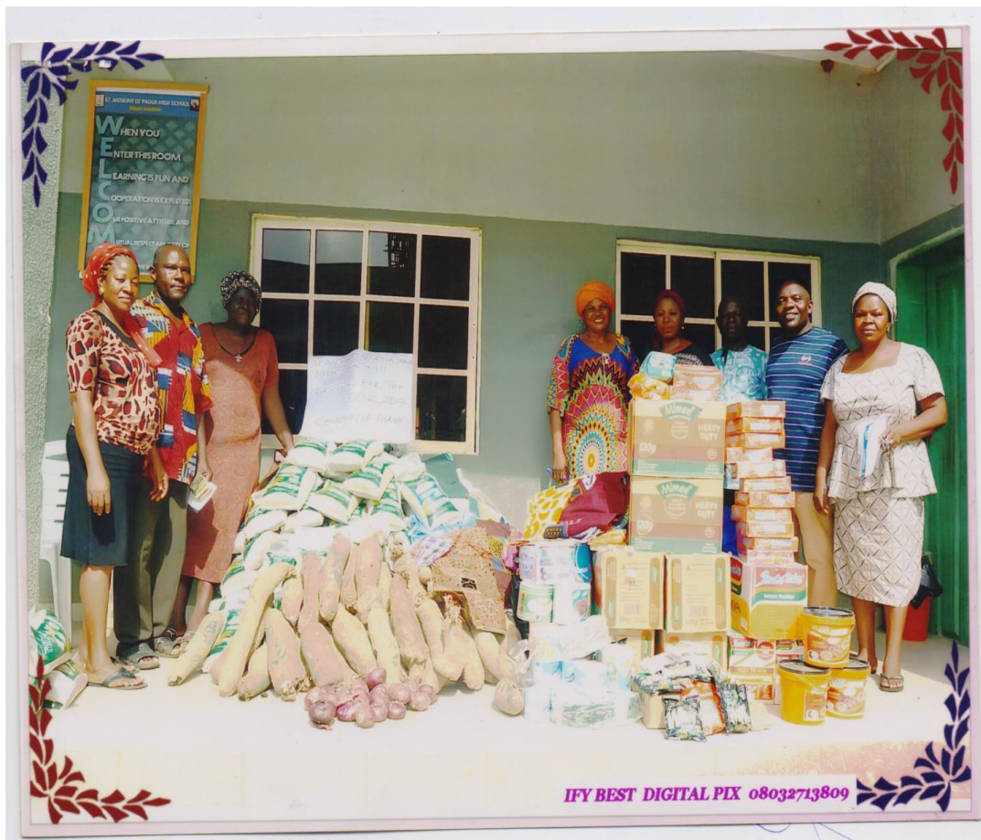
St. Anthony's Nkpor Parish JDPC with the various items for the needy.