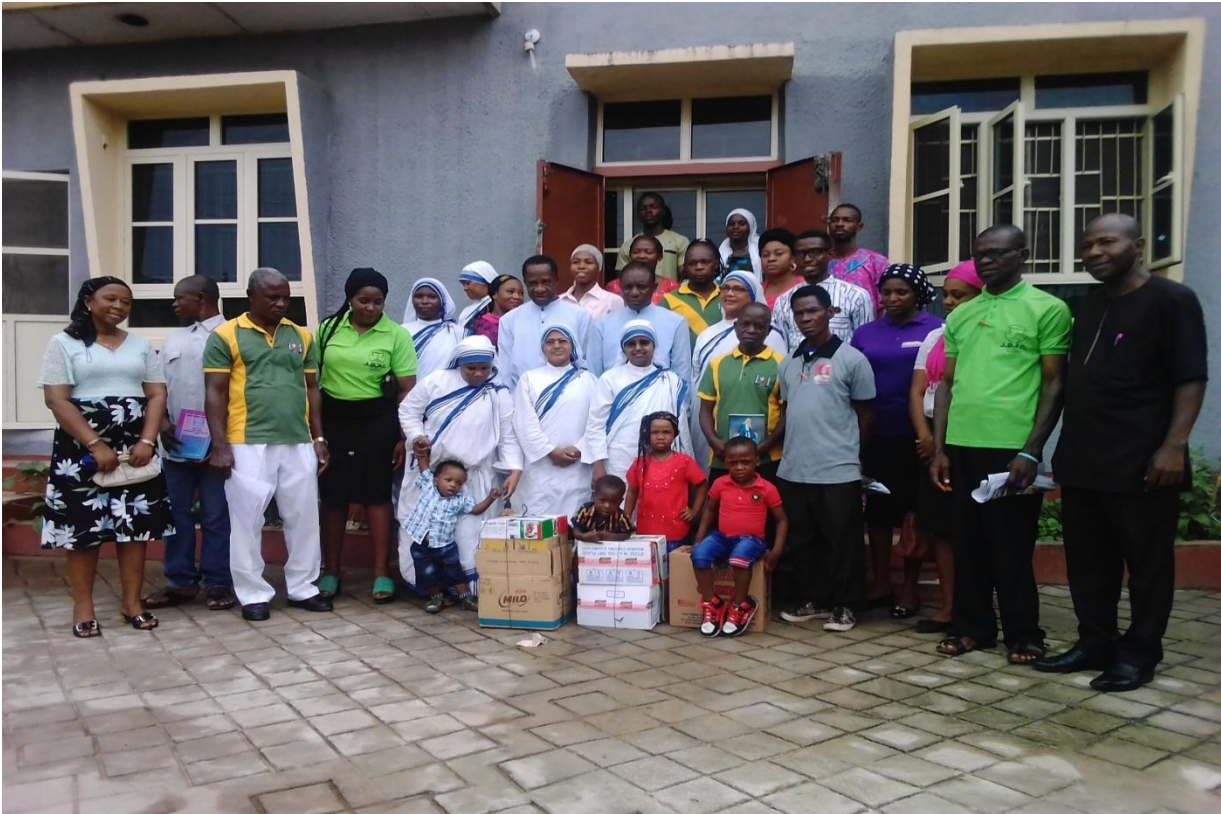
JDPC Team with other celebrants at the World day of the Poor