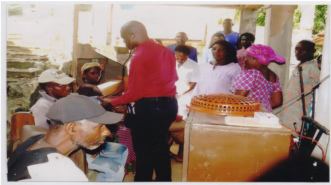
Beneficiaries of the JDPC St Dominic's Abatete medical intervention