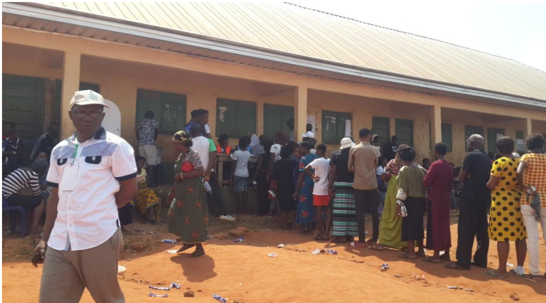
Voting in one of the polling units in Aguleri, Anambra East LGA.