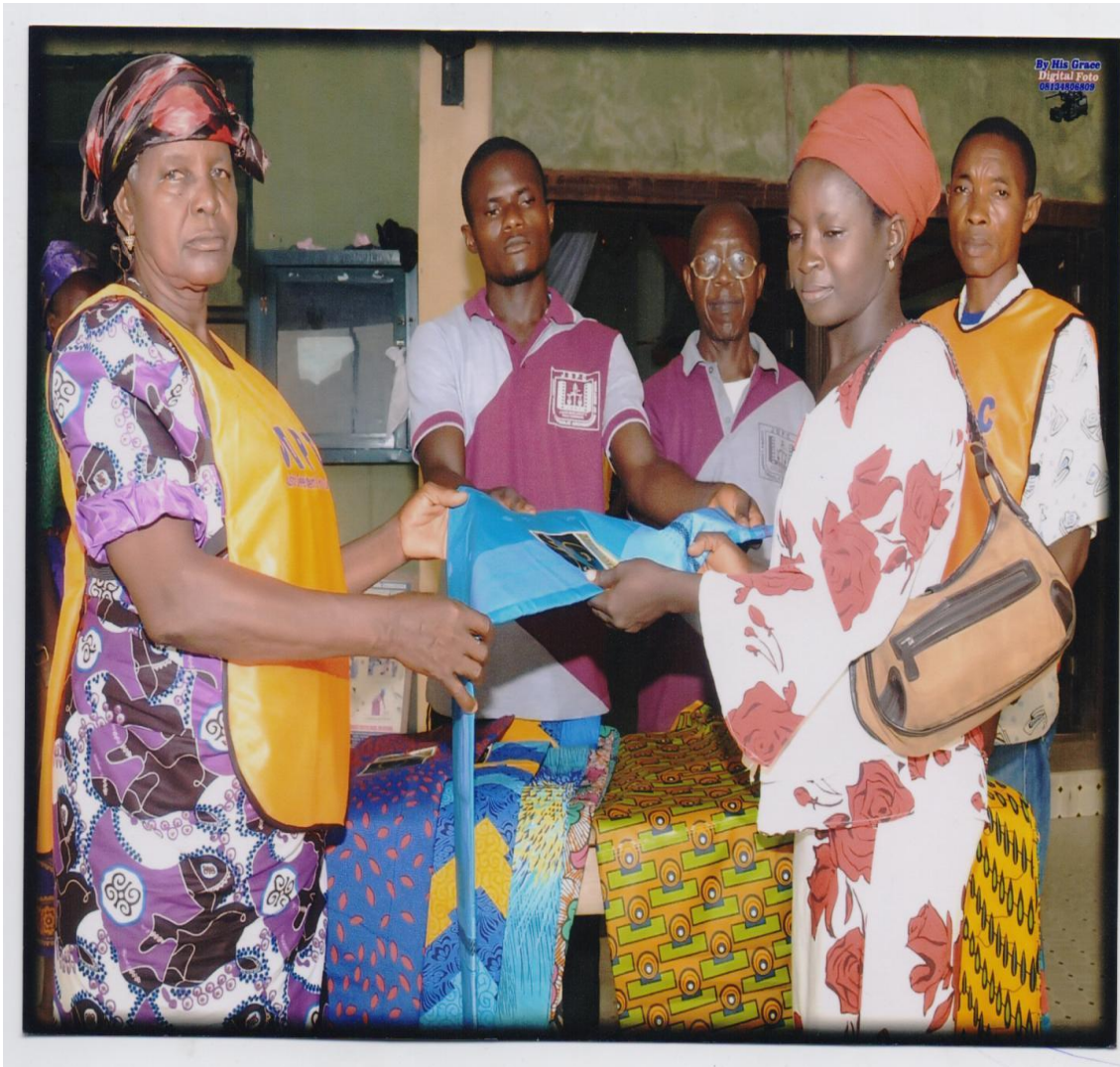
Members JDPC St. Joseph Atani with the beneficiaries at 2017 Christmas for the poor.

Christmas for the Poor: JDPC St. Joseph gave out food items rice, tomatoes and cloths worth over ₦100,000 to the needy parishioners.