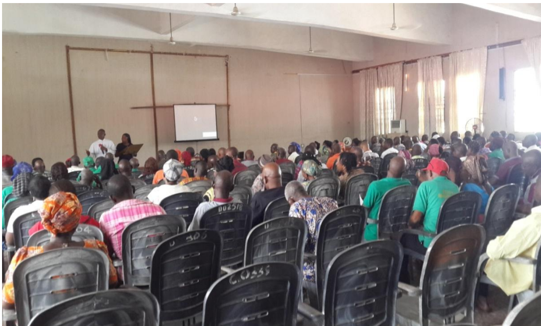
Cross section of the Annual Seminar Participants