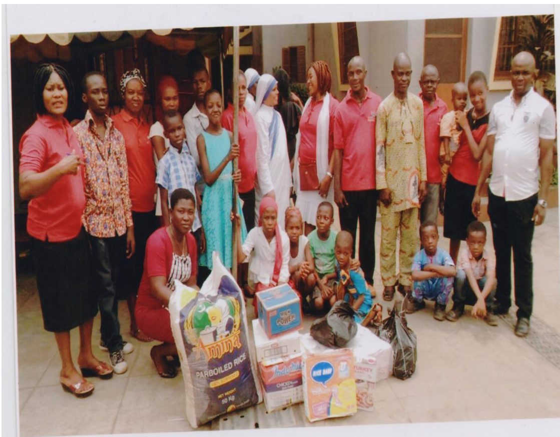
Sacred Heart Odoakpu P-JDPC with special children at Valentine for the children.

Valentine for Special Children: Sacred Heart Parish JDPC spent over N80, 000 on feeding and clothing the children with special needs.