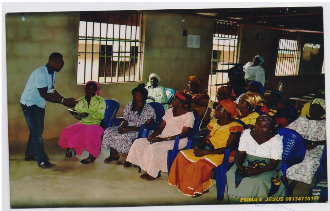
JDPC St Mary's Officials with the participants at the Mechanized Fish Farming Training