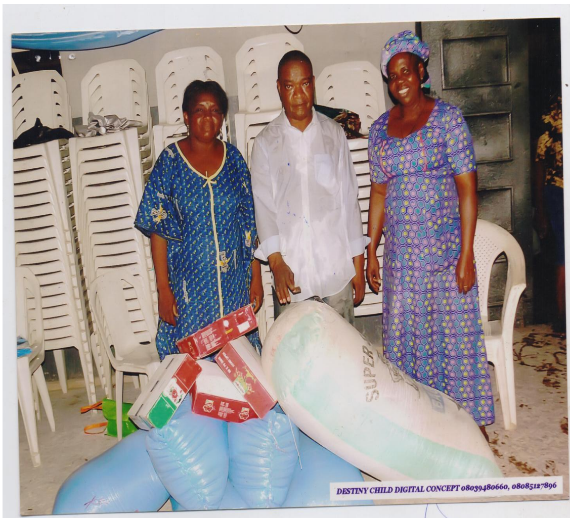
St. John Odoakpu JDPC - food items for distribution to the poor and needy

Christmas for the Poor: Food and clothing materials namely: six bags of rice, 1 bag of beans ½ bag of onions, two hundred tubers of yams, 5 cartons of tomatoes, indomie noodles and 3 bags of brand new and used cloths at the cost of N350, 000 were given to one hundred and twenty poor and needy parishioners.