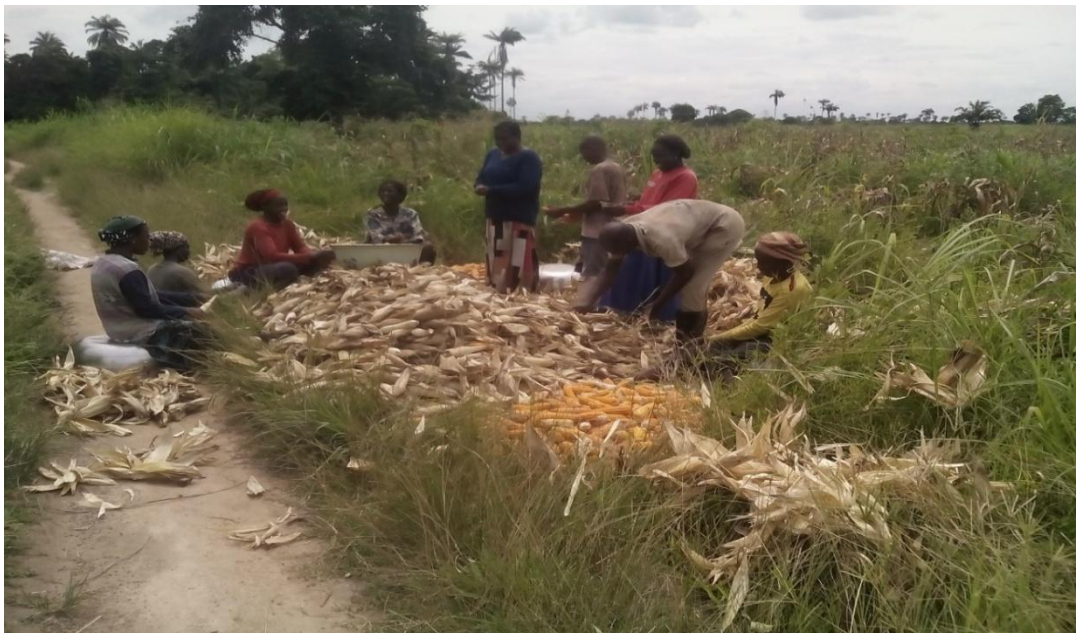
Harvesting of Maize at JDPC farm St. Andrew Catholic Church Omasi-Uno, Anyamelum LGA

JDPC Onitsha partnered with St Andrew's Catholic Church Omasi-Uno on maize production. The farm covers about 29 hectares of land.