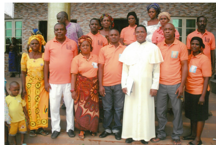
JDPC Our Lady's and Parish Priest during the JDPC week program

Christmas for the Poor: Food items worth over N40, 000 were shared to the poor and sick in the parish.