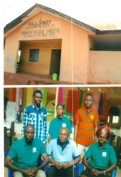
JDPC Our Lady of Victory on Monitoring visit to Holy Trinity Catholic School Umueri

Advocacy to Anambra East Education Authority: JDPC Our Lady went on advocacy visit to the Education Secretary of Anambra East Local Government. This resulted in posting two federal teachers and four teaching practice students.