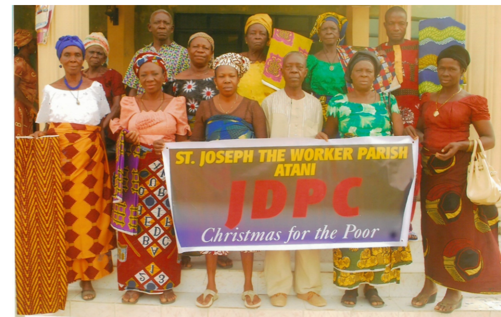
Members of JDPC St. Joseph Atani with some beneficiaries