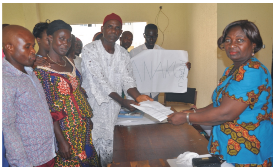
Anaku community engaging the head of Local Government with Community Demand Charter