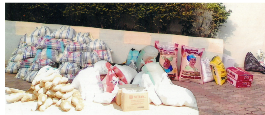
During Christmas Charity to the poor

Christmas for the poor: Cash ranging from N1, 000 –N3,000 each was given to 30 parishioners. Bags of rice, tubers of yams, cartons of tomatoes, onions, indomi-noodles and cloths worth over N100, 000 were distributed to 190 poor and needy persons from different part of the town and parishioners.