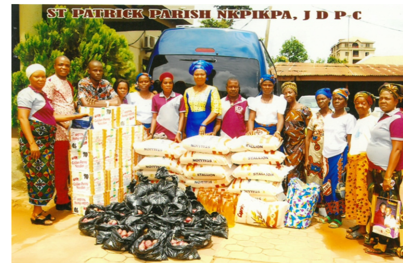
St Patrick's Nkpikpa JDPC distributes foods to the poor and Aged.