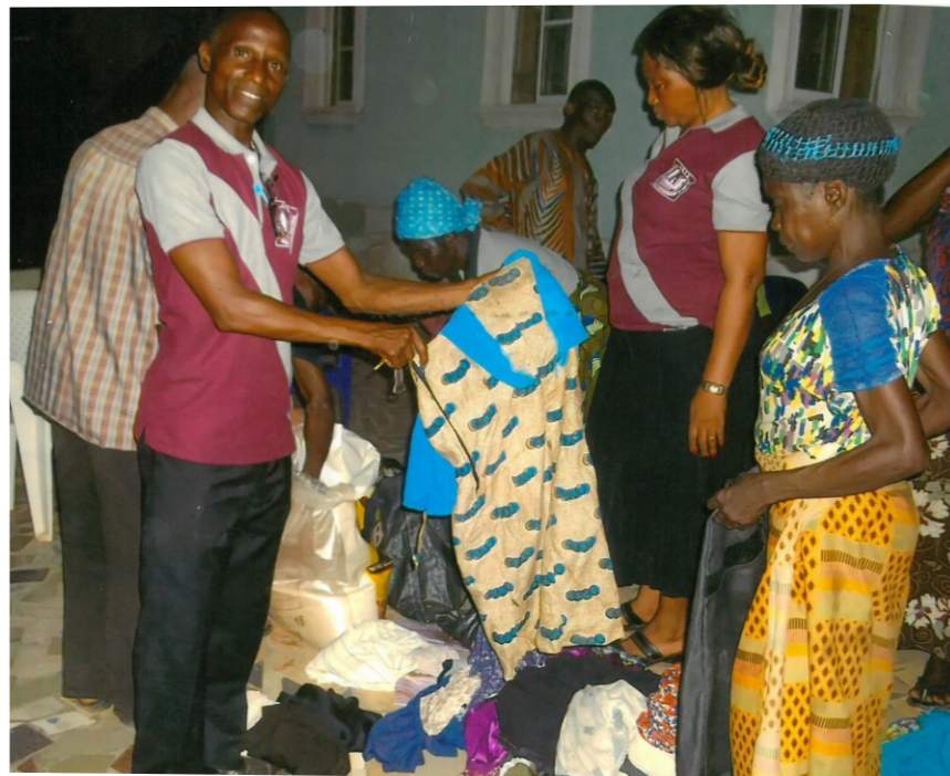
JDPC Madona Parish distributes foods and cloths to the poor during Christmas

Christmas for the Poor: Food items worth over N80, 000 was shared to the 52 poor and sick in the parish.