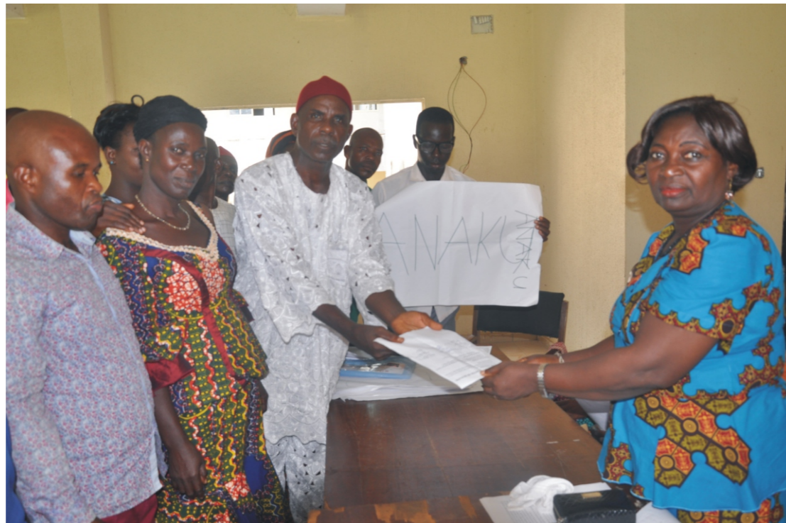
Anaku community engaging the head of Local Government with Community Demand Charter

• Charter of Demand: This is a working document developed by JDPC Onitsha for the community members to use for engagements with the relevant government Ministries, Departments and Agencies (MDAs) in presenting their prioritized needs for community development. 40 communities have continuously developed demand charters as the community need arises. Over 90 demand charters have been developed throughout the duration of the project by the community members. Community advocacy and demand for accountability using community demand charter have contributed to development of Education, Health and rural infrastructures. Interestingly, the government is developing interest in these charters as demands are being made for inserting them in state budgets. Before JDPC-V2P intervention governments have been spending fabulous money on elephant projects that had no relevance to the community. Lots of abandoned projects littered many communities. Demand charter is veritable tool for communities to demand their needs from government and the same time track government response and action in providing the needed infrastructural facilities. It is interesting to note that the era of empty campaign promises has gone as today many communities present and sign their demand charter with politicians.