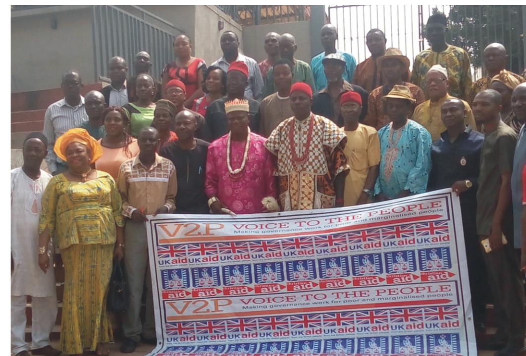
V2P engages with all members of the community for effective governance.

practices to be camaraderie through advocacies. Within the four years of this project a lot of impacts, achievements and innovations for development have been registered and successfully applied. Thus, below are some of the outstanding impacts of the project after four years of the intervention.