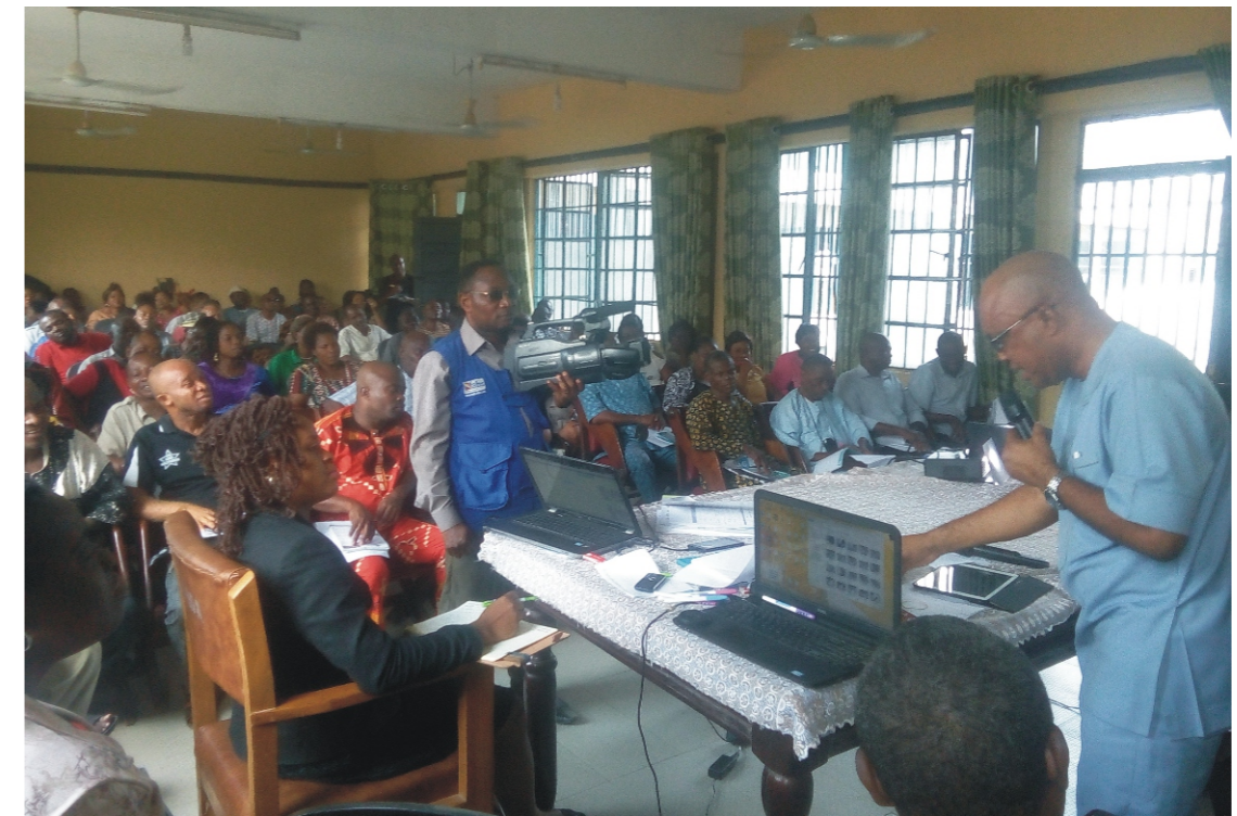
JDPC support community groups to interface with Anambra State Business Agency (ASBA)