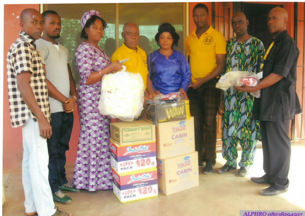
St. Jude Parish Fegge JDPC distributes foods and cloths to the needy