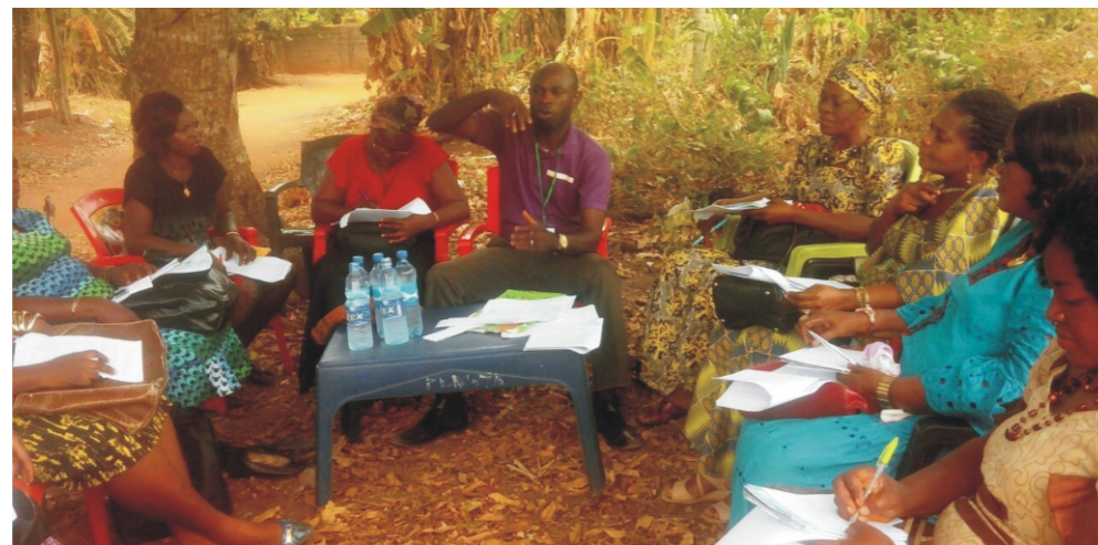
JDPC/V2P Project Officer training Women Voter Education Facilitators.