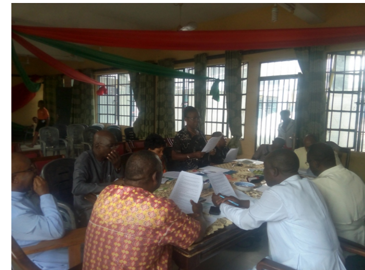
JDPC Board of Directors

JDPC Onitsha has Board of Directors made up of professionals and consultants from various works of life. They meet three times a year to formulate and approve strategic policies and programmes of JDPC Onitsha.