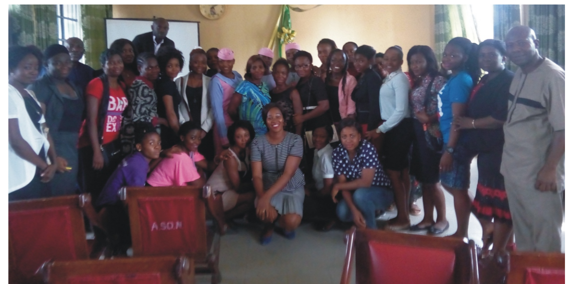
JDPC/V2P team with members of Girls parliament