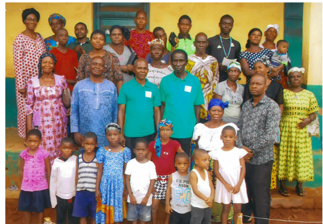
JDPC St Joseph Aguleri during the 2016 JDPC Week

JDPC Week: The 2016 JDPC week was well attended. External resource persons were invited and the Lenten week guide was followed.