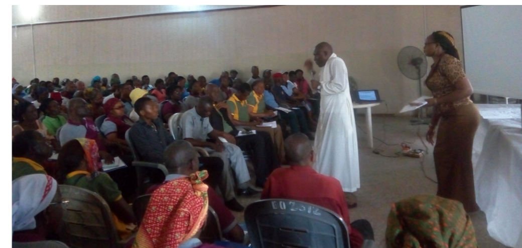
Members of Parish JDPC in one of their meetings

P-JDPC Archdiocesan Meetings: There are over 92 parishes with functional JDPC within the six Regions of the Archdiocese of Onitsha. The Archdiocesan JDPC meets every quarter (four times every year). Archdiocesan JDPC meetings are normally attended by authorized delegates from the parish JDPCs spanning from 150 -200 members.