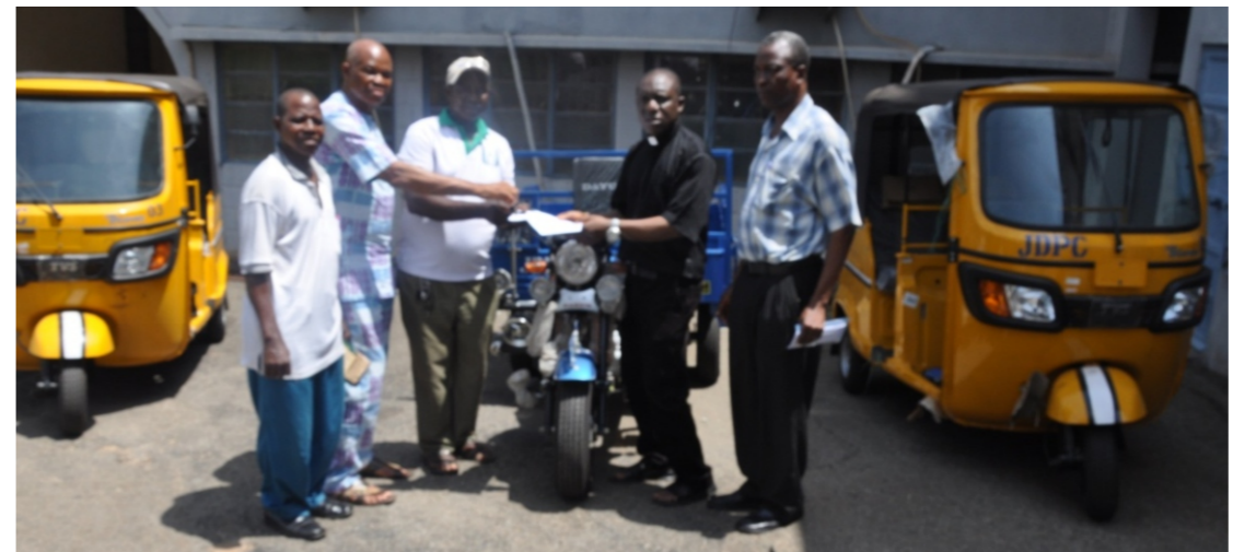
A beneficiary receiving one of the KEKE Trucks key

Keke (Tri-Cycle) is an empowerment based transportation support project aimed at empowering interested committed publics in a sustainable way. Six (6) additional Keke were given out at the cost of ₦3,250,150 (Three million two hundred and fifty thousand one hundred and fifty naira) were given to the willing operators. This brought the total number of Keke Tri-cycle so far given out to twelve (12). JDPC Onitsha was supported by four new keke by a committed philanthropist to realize this goal. Beneficiaries of this project have appreciated JDPC Onitsha for helping them to alleviate their poverty in a sustainable way.