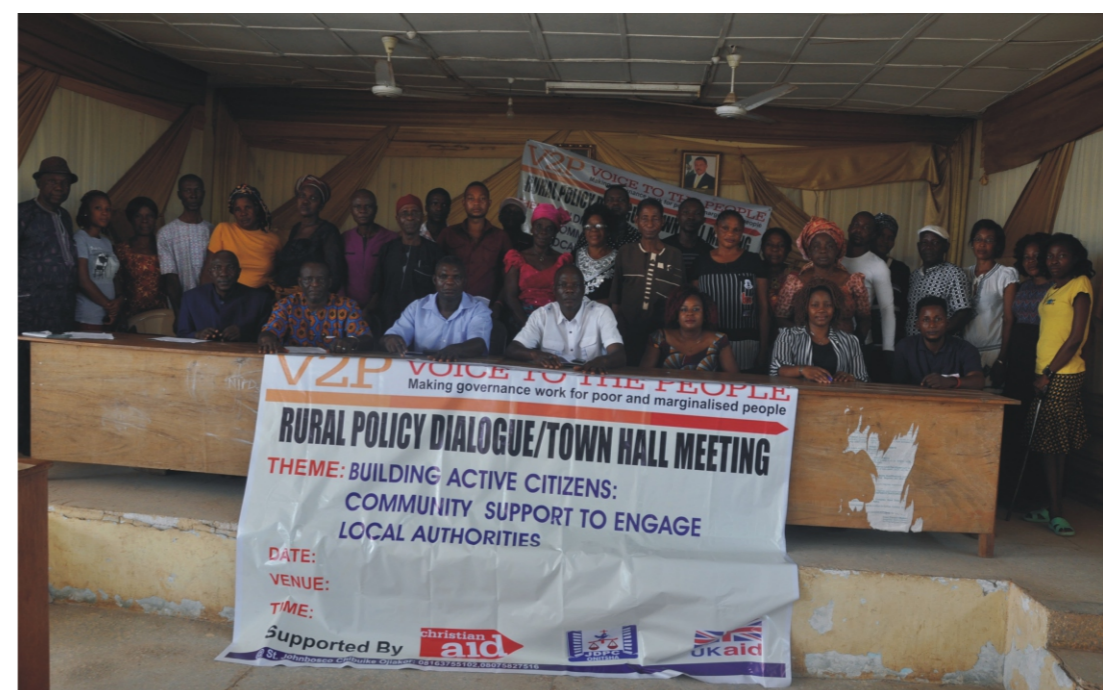
JDPC support COMEN to organize Town Hall Meeting