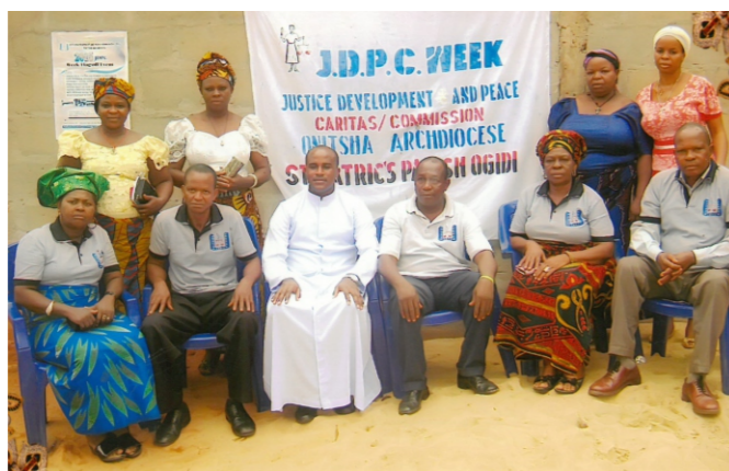
JDPC St Patrick with Parish Priest at the JDPC week.