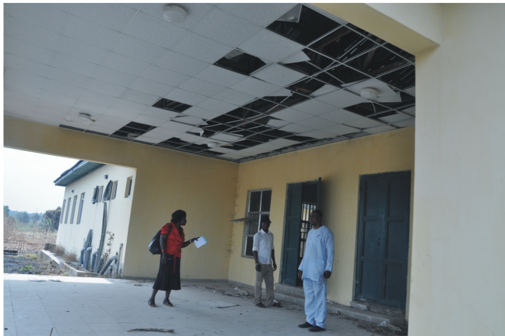
COMEN Ayamelum monitoring project with LG information officer