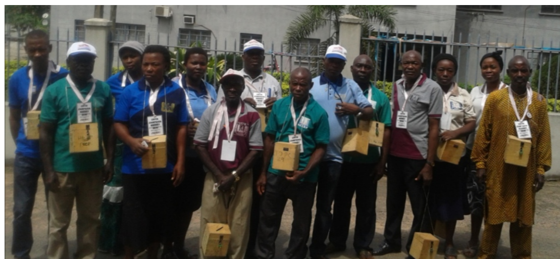
JDPC Market Lenten Campaigners about to move

JDPC as usual conducted the market Lenten campaign with new style of engaging each region to go to specific markets for the campaign. The JDPC members demonstrated their faith during the campaign as they solicited for funds for corporal works of mercy. Specifically, Onitsha Region covered the Main market and Ochanja market. Dunukofia Region covered new parts market, New Tyre market and Old parts market Nkpor. Iyiowa Region covered Head-bridge/medicine dealers market, Electronics market and Ogbaru relief market. Igbariam Region covered Building material market and Bakery materials market Ogidi. Nnobi Region covered Nnobi market, Mgbuka market Obosi and Electricals market Obosi and Aguleri Region covered Otuocha market Umuoba Anam and Ose market Onitsha. The turnout was over 100 participants.