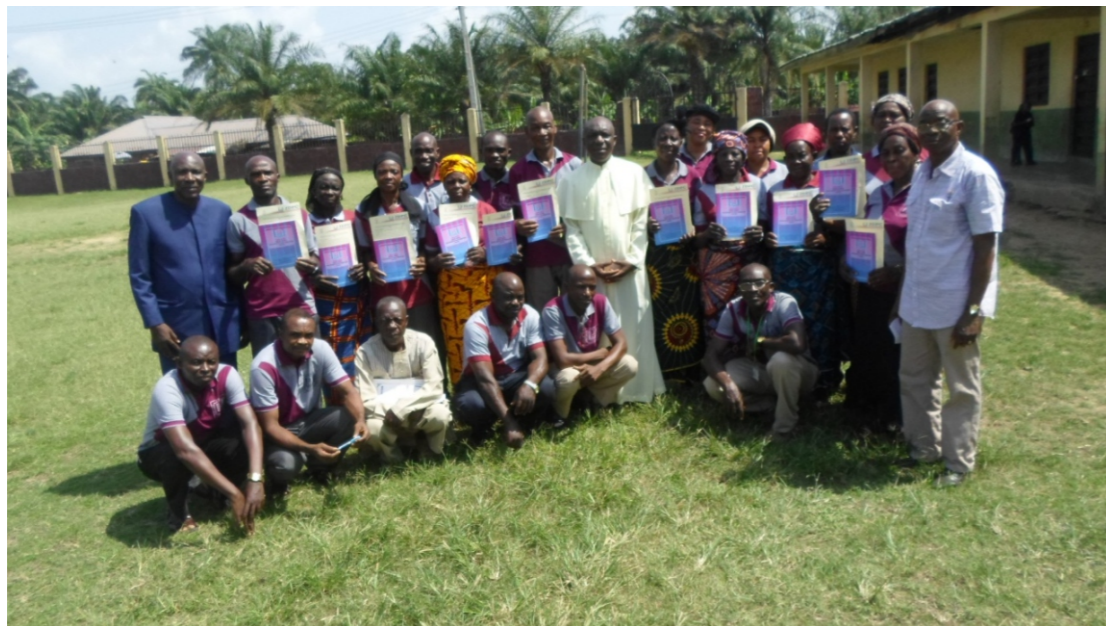
P-JDPC St. Mary's Parish Ochuche-Umuodu Inuaguration

The year 2016 witnessed an improvement in parish JDPC activities. 10 (ten) new parish-JDPCs were inaugurated bringing the total number of parishes with JDPC to 92. This brought an additional 123 JDPC members leading to a total of 1,933 JDPC memberships in the Archdiocese. JDPC Onitsha also recorded over 100 new volunteers within the year. The new JDPC parishes include: St Michael's parish Fegge, St Anthony parish Umudioka, St Mary's parish Ochuche-Umuodu, St Mary's Parish Alor, Our Lady of Seven Sorrows Umuoji. St Mary's parish Nnokwa. St John De Baptist Ogbakuba, St Theophilus Parish Nkwelle-Ezunaka, St Dominic's Fegge and etc.