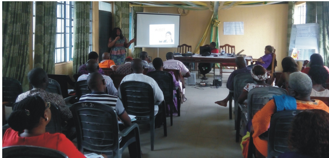
JDPC Project officer- V2P, training community members on right based approach