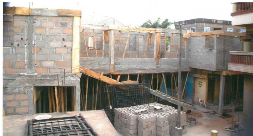
Rebuilding of Health Centre monitored by JDPC St. Augustine Umuoba-Anam