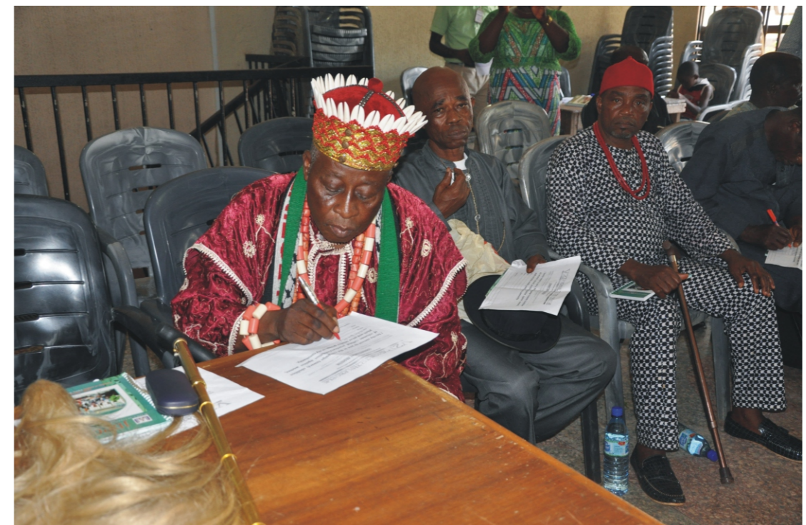
Traditional Ruler of Umueje, signing the commitment register