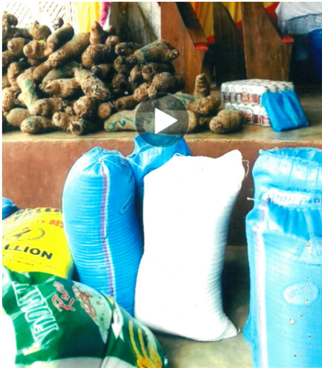
JDPC St Dominic's Uke distributed food and clothing to both parishioners and communities

Christmas for the Poor: JDPC St. Dominic's Uke with the support of HRM Igwe Oranyelu 111 provided the following to the poor and needy in the Church and community: 37 bags of rice, 105 tubers of yams, wrappers, shoes, sandal and fairly used cloths worth N450, 000 were distributed on 24 & 31 st December respectively.