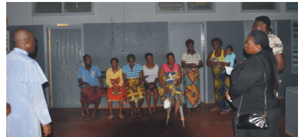
At Holy Rosary Hospital