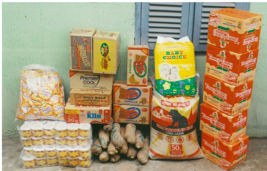
St. Francis Parish Okpoko JDPC's donation to the poor, needy & motherless babies