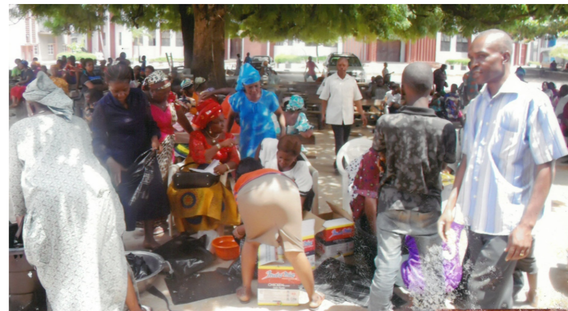
Food items distributed by St. Mary's Onitsha Parish JDPC to the poor.