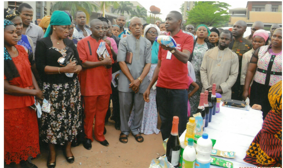
JDPC SS John & Paul with Consumers Protection Council during sensitization