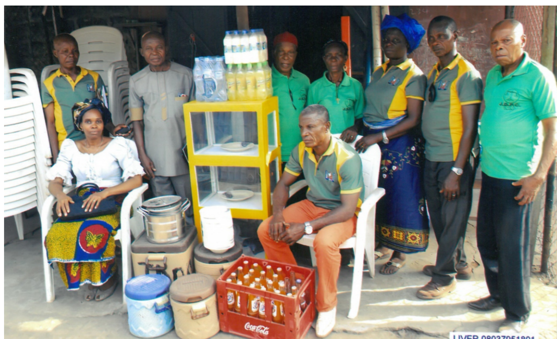
JDPC Immaculate Heart at the Office Shop Empowerment Project site.

Archdiocesan JDPC hosting and sensitization: JDPC IHM hosted the fourth quarter Archdiocesan P-JDPC meeting/ sensitization. This resulted in 15 more JDPC volunteers' members being inducted into the parish JDPC.