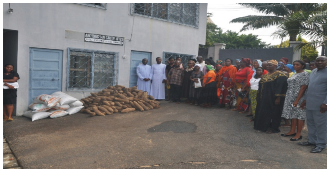
JDPC carrying out its caritas function with the Caritas Unit

To relieve the burden of indigent people JDPC through the CARITAS unit spent N200,000 to provide food items to identified persons.