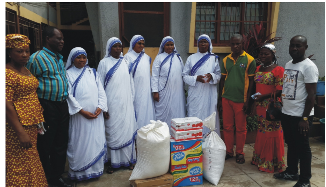
Missionary Sisters of Charity posing with JDPC members

On the 27 th of September, 2016, the JDPC Onitsha visited the motherless babies' home operated by the Missionaries of Charity Fegge. There, a little time was spent with the motherless kids of different age brackets. Afterwards, the Director of JDPC blessed the kids and the workers. In addition to the spiritual gift, was material gifts which included gift items and a cash sum of N50,000 The superior of the home, in appreciation, expressed her delight on the work of JDPC.