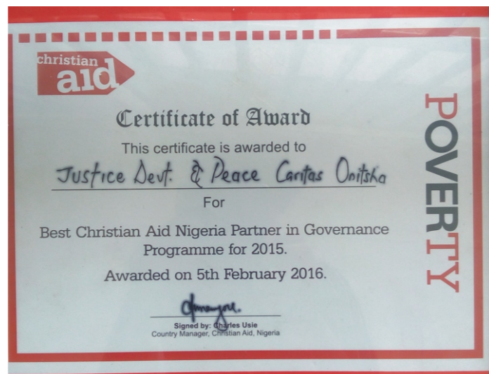
2016 Award Picture