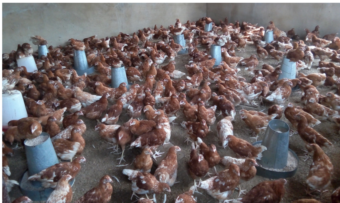
CADO Poultry Farm