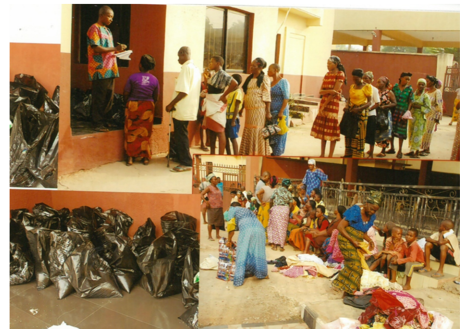
St. Theresa's Parish Obosi Christmas for the Poor.

Christmas for the Poor: 5 bags of rice, 5 cartons of tomatoes, 5 bags of salt, 5 packets of knorr cube and cloths worth N57,300 were distributed to the poor parishioners.