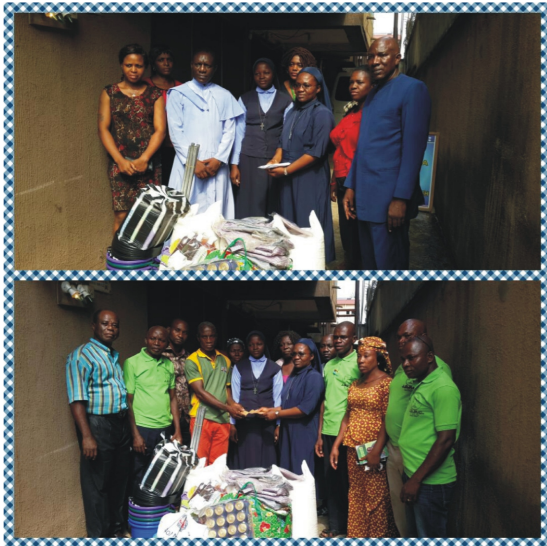
Sisters of the Needy posing with JDPC crew

On Sunday, 6 th of November 2016, JDPC Onitsha made another Year of Mercy journey to Ogwuikpele across the River Niger. It was a journey of about 40 minutes on top of the River Niger from Ossamala