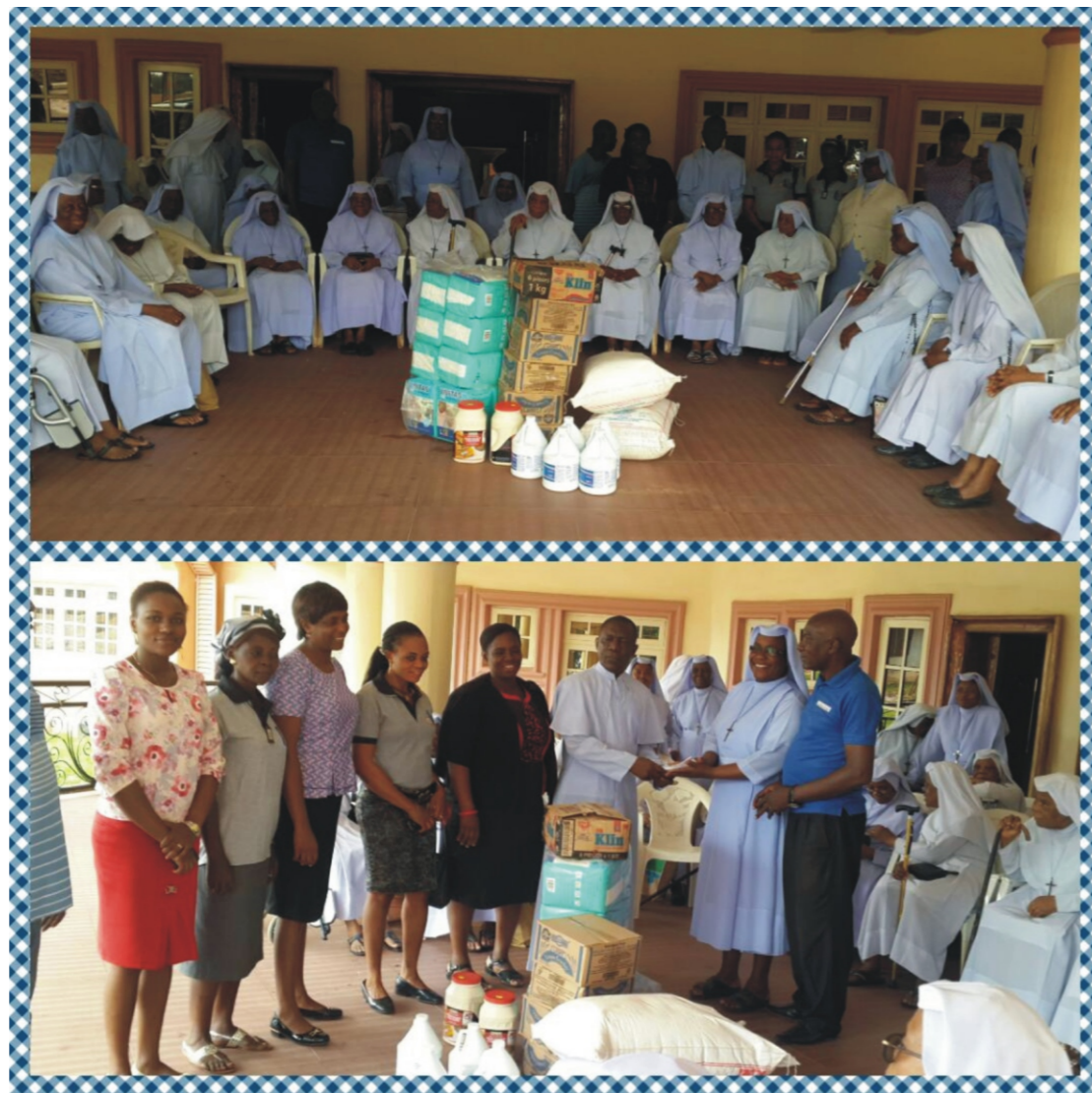
The aged & sick Rev. Sisters and the JDPC team