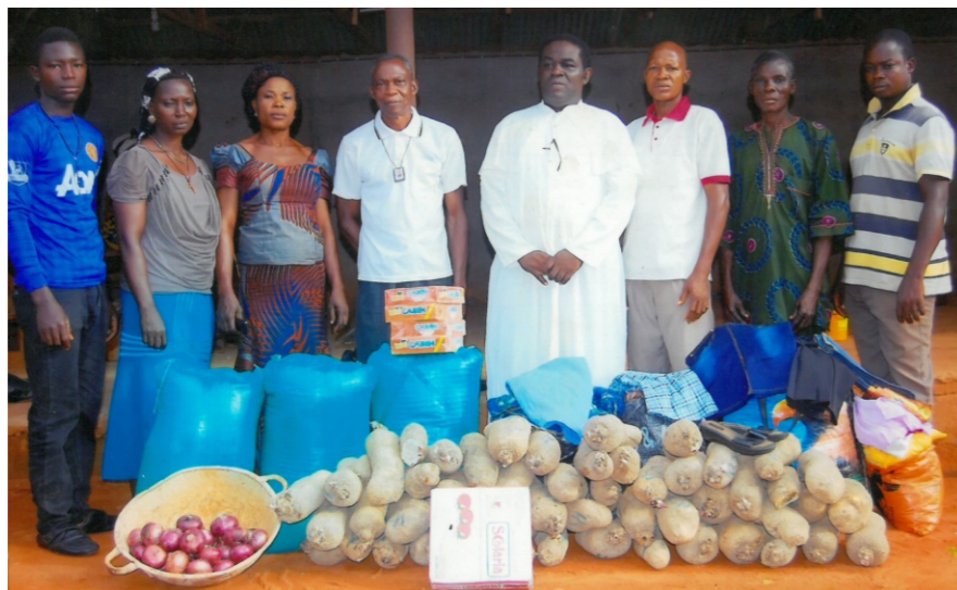
Parish Priest, St Francis Ifite Aguleri Parish JDPC Donated food for the Poor

The JDPC St Francis Ifite- Aguleri participated in the following caritas interventions in 2016. Three bags of rice, yam, tomato worth N82, 450 and cloths were shared to the less privileged from Igboezunu, St. Peters Abor outstation and the main parish.