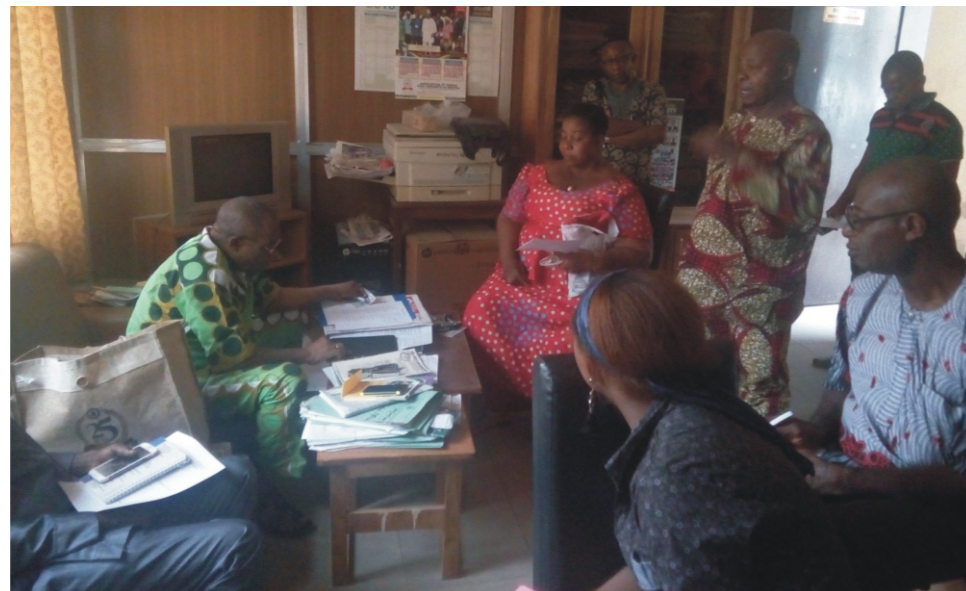
MEp4D members lead trade unions to engage ministry of Information