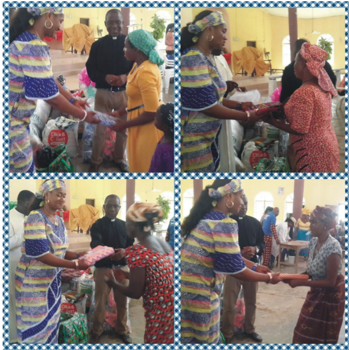
Some of the women receiving their brand new wrappers with joy

After the holy mass, the gift items JDPC went with to Ogwuikpele were distributed to the people beginning with the issuing of 60 brand new wrappers to women especially the widows and the poorest in the communities. The recipients of the wrappers were visibly happy and over-joyed with the year of mercy gesture showed them by JDPC Onitsha.