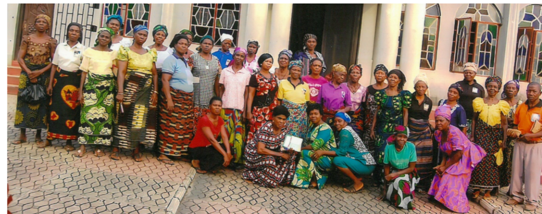
Members of St. Odilia's Ojoto Parish JDPC and Beneficiaries of their empowerment program.