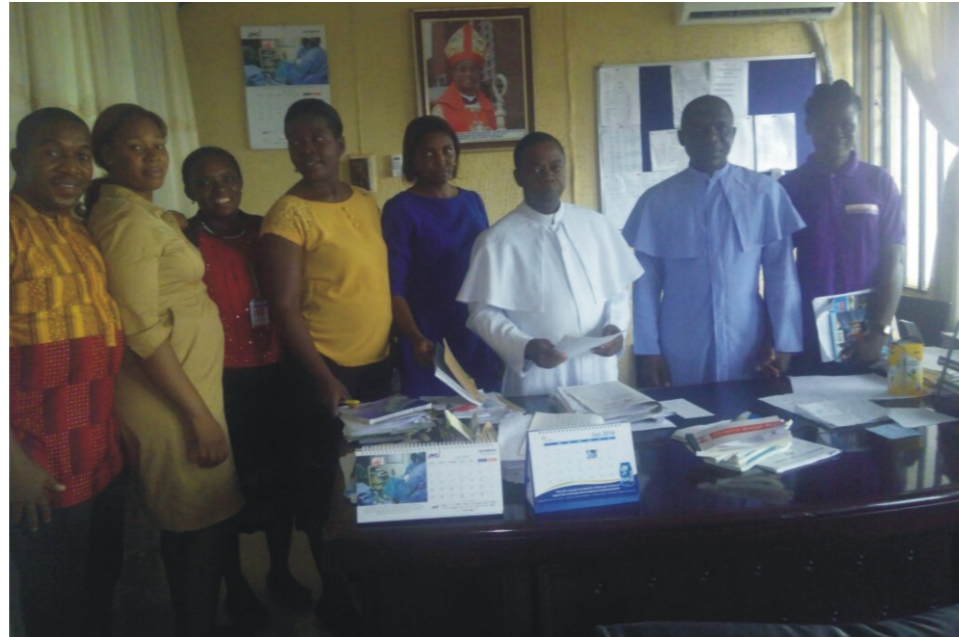
At Iyienu Anglican Hospital, Ogidi

b) While at Iyienu Hospital Ogidi the total amount of N299370 was paid to discharge 8 patients (3 female and 5 male).