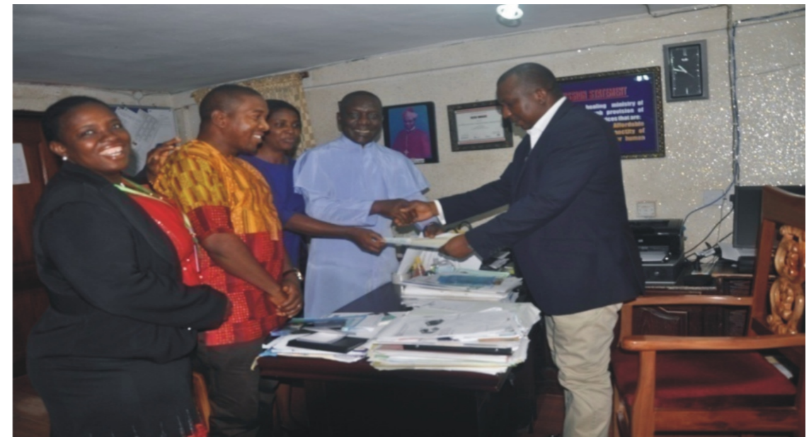
At St Charles Borromew Hospital Onitsha