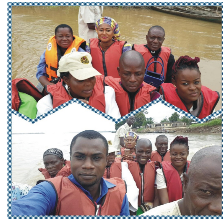
The visiting JDPC crew on top of River Niger

On Sunday, 6 th of November 2016, JDPC Onitsha made another Year of Mercy journey to Ogwuikpele across the River Niger. It was a journey of about 40 minutes on top of the River Niger from Ossamala