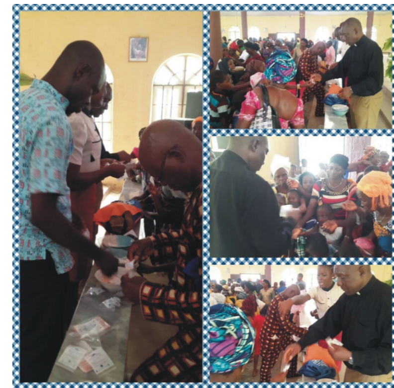
De-worming exercise going-on

JDPC did not stop at distribution of material gift items alone. They went further to de-worm the whole community members present totaling about 750 people. Of course, the Director was active as ever together with his staffs in the de-worming exercise too in the company of two staff nurse from Ogbaru LGA.